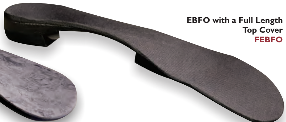
EBFO with a Full Length Top Cover FEBFO