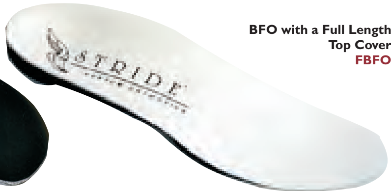
BFO with a Full Length Top Cover FBFO