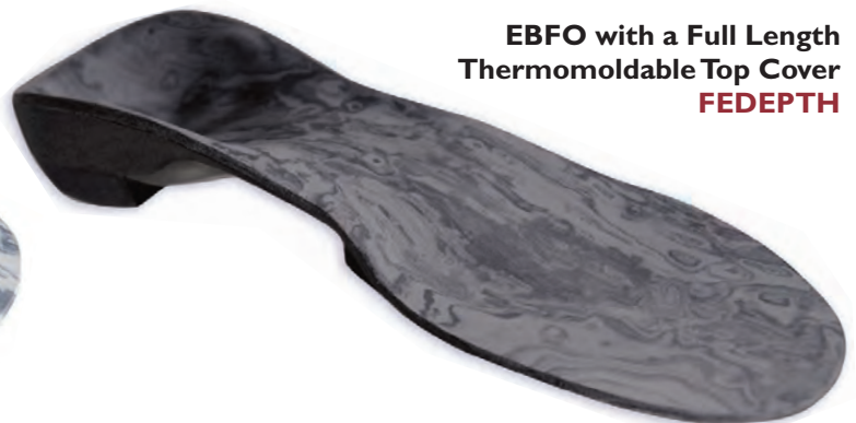
EBFO with a Full Length Thermomoldable Top Cover FEDEPTH

All DEPTH orthoses require Extra Depth footwear