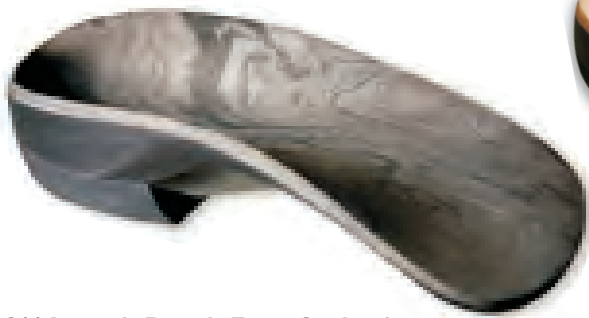
3/4 Length Depth Foot Orthotic Ending at Met Heads DEPTH