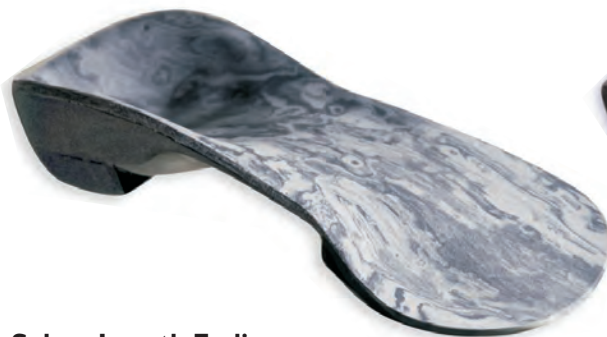
Sulcus Length Ending Under the Met Heads EDEPTH