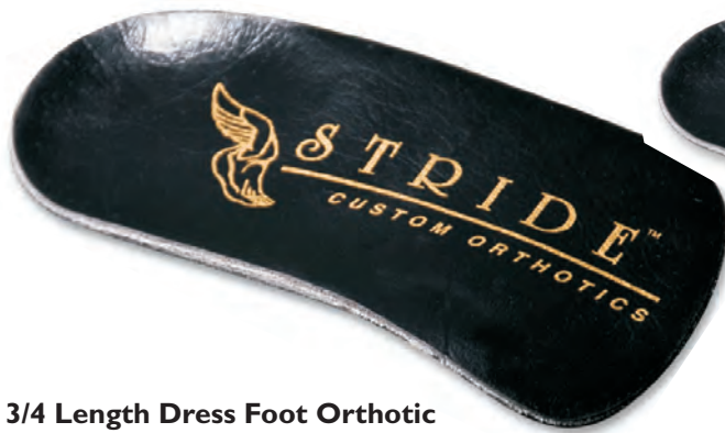
3/4 Length Dress Foot Orthotic Ending at Met Heads DFO