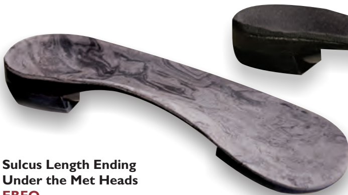
Sulcus Length Ending Under the Met Heads EBFO