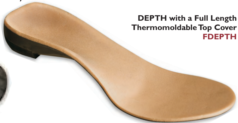
DEPTH with a Full Length Thermomoldable Top Cover FDEPTH

All DEPTH orthoses require Extra Depth footwear