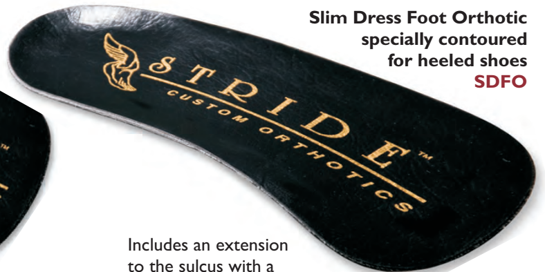
Slim Dress Foot Orthotic specially contoured for heeled shoes SDFO

Includes an extension to the sulcus with a metatarsal pad