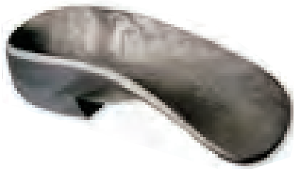
3/4 Length Depth Foot Orthotic Ending at Met Heads PFO