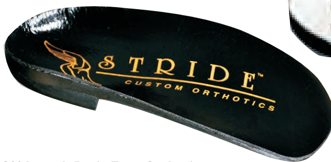
3/4 Length Basic Foot Orthotic Ending at Met Heads BFO